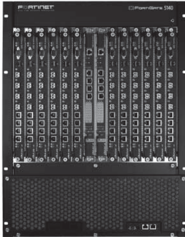
FortiGate-5140 Chassis (Front view)