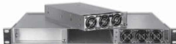
FortiGate-5053 Power Converter

The FortiGate-5053 Power Converter allows for AC power inputs, supports 1 + 1 redundant, hot-swappable modules, and up to 3 power supply modules. Mounts above or below the FortiGate-5140 chassis